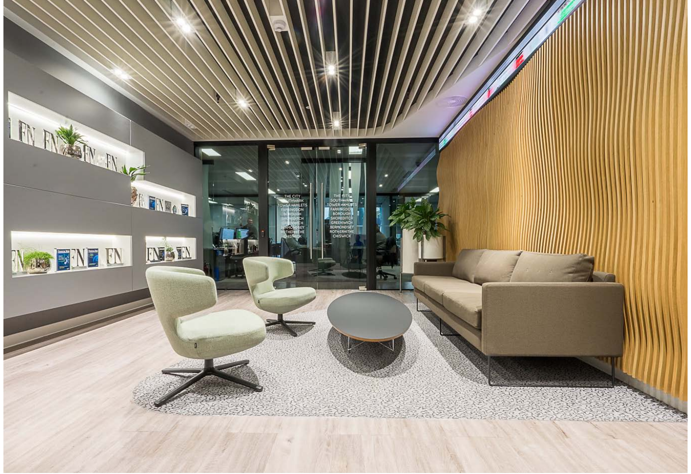
THE WORKSPACE CONSULTANTS LLP

"The Workspace Consultants provided a valuable breadth of services and expertise to our project. Navigating this process and all the people involved would have been very difficult without their partnership and dedication. They delivered advice and guidance that resulted in a successful, impressive space that we are proud of and comfortable in." Clem Marsh - Head of Infrastructure, Europe