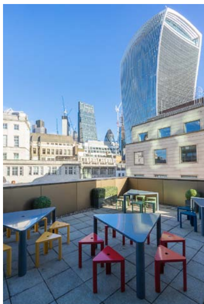
THE WORKSPACE CONSULTANTS LLP