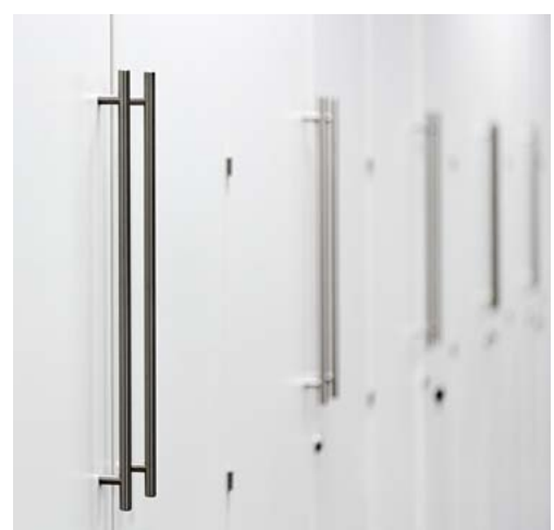
THE WORKSPACE CONSULTANTS LLP