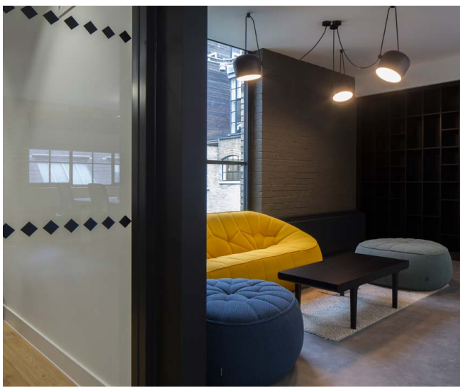
THE WORKSPACE CONSULTANTS LLP