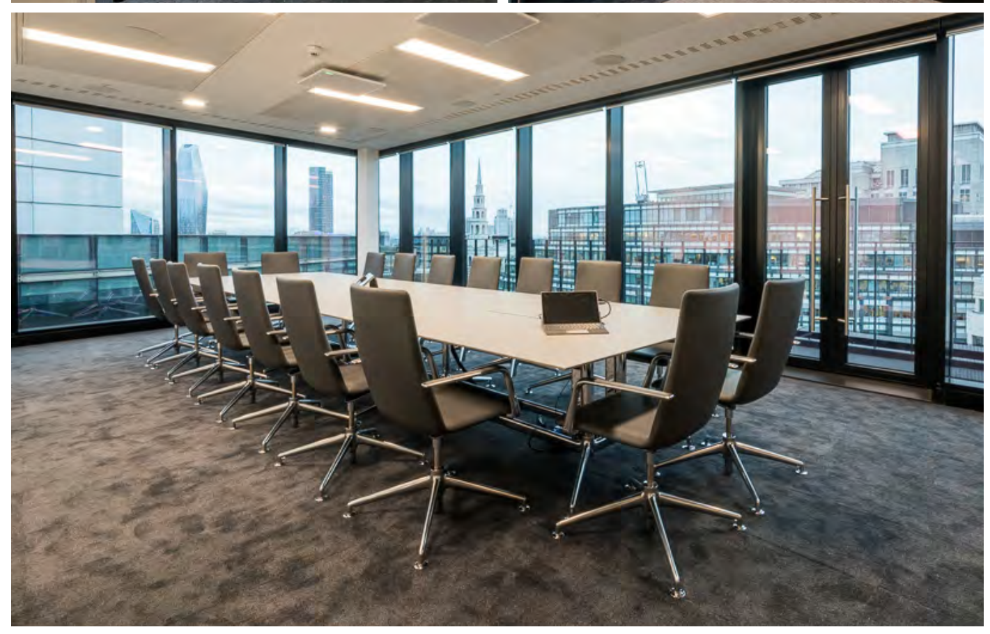
THE WORKSPACE CONSULTANTS LLP